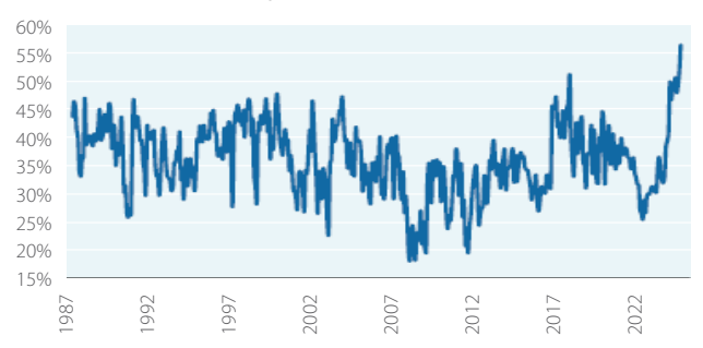
Exhibit 3: Share of US Households Expecting Higher Stock Prices in 12 Months (Percent of Respondents)

As of 30 Nov 2024.