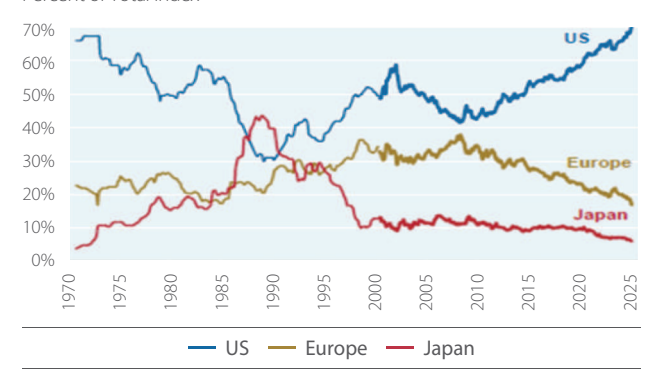
Exhibit 1: Regions as a Share of MSCI World Index Market Capitalization Percent of Total Index

Source: Bloomberg/JPMAM. As of 29 Nov 2024.